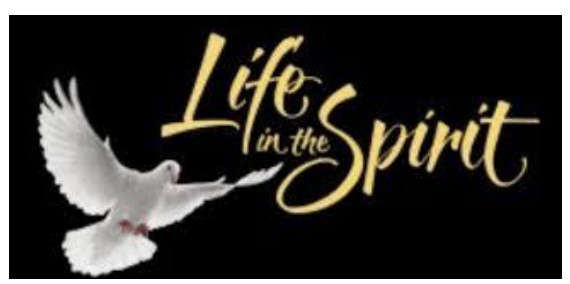
Life in the Spirit Seminar

St Joseph's will be hosting the Life in the Spirit Seminar on Saturday, June 8th.